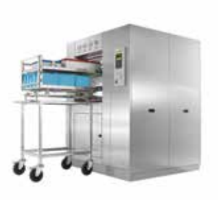
Large sterilizers for various industries and market needs

More from Tuttnauer: Featuring Tuttnauer's range of cleaning, disinfection and sterilization solutions