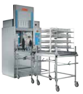
Washers/disinfectors for hospitals and laboratories