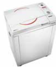
Laboratory autoclaves ranging in size and application