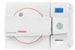
Pre & post vacuum tabletop sterilizers designed to perform class B cycles