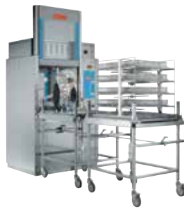
Washers/disinfectors for hospitals and laboratories