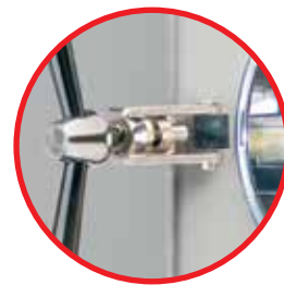
Double locking safety device

Complies with strict international directives and standards: