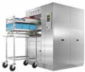
Large sterilizers for various industries and market needs

Featuring Tuttnauer's range of cleaning, disinfection and sterilization solutions